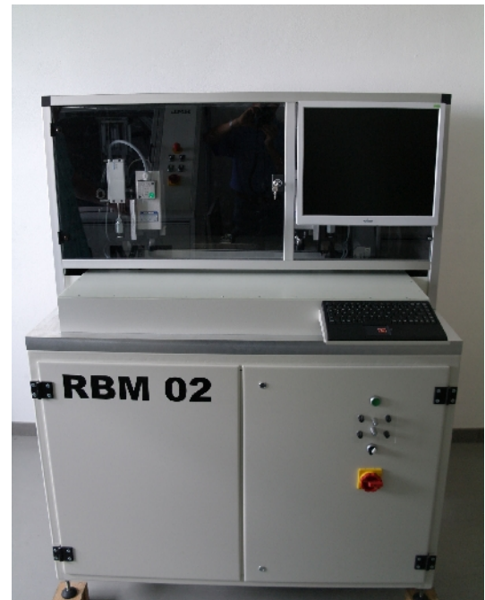
RBM 02 Frontview